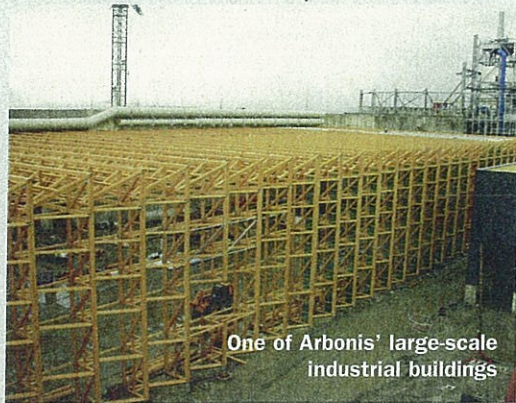
One of Arbonis' large-scale industrial buildings

ventilation, insulation and intelligent home automation" systems as its upmarket models, but cost considerably less, starting at €199,950.