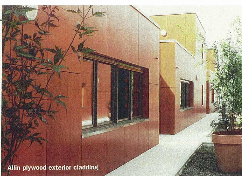
Allin plywood exterior cladding

Another exhibitor, wood flooring and decorative interior panels specialist Artepy, describes itself on its website ( www.artepy.fr ) as a "fertile source of futuristic inspiration"! One product it suggests has UK potential under-